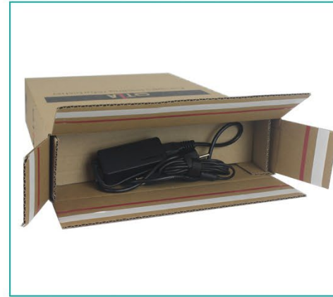
7. Put the laptop cable in the placeholder