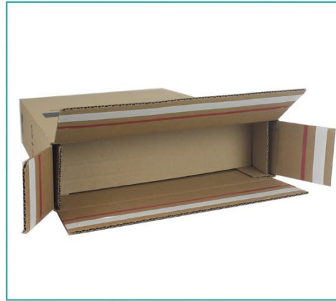
6. Put the placeholder on the top of the laptop.