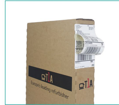
9. Stick the return address on the top of the shipping address. The return address is: Solvang 6, 3450 Allerød, Denmark.