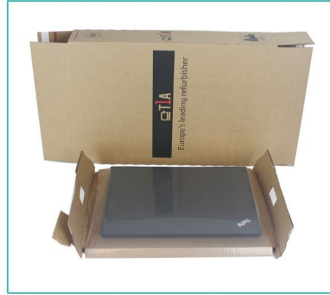
3. Place the laptop in the box in the clampshell and fold it.