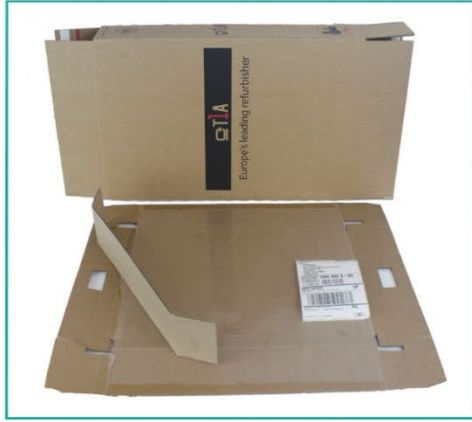
2. When opening the box, find the label with the return address, the clampshell and placeholder for the cable