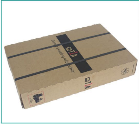
1. Open the box by cutting the black straps