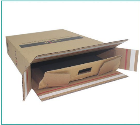
5. Place the laptop in the box with the folded carton clampshell.