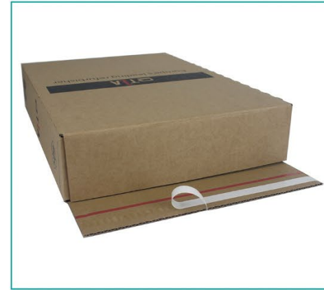
8. Seal the box. Check if it is well closed.