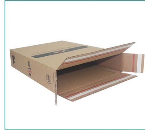
4. Remove the white straps on one side of the box and fold it as a base. Leave the other side open to place the laptop.